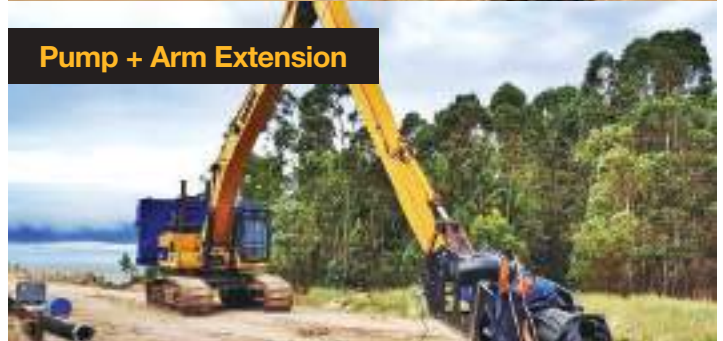
Pump + Arm Extension